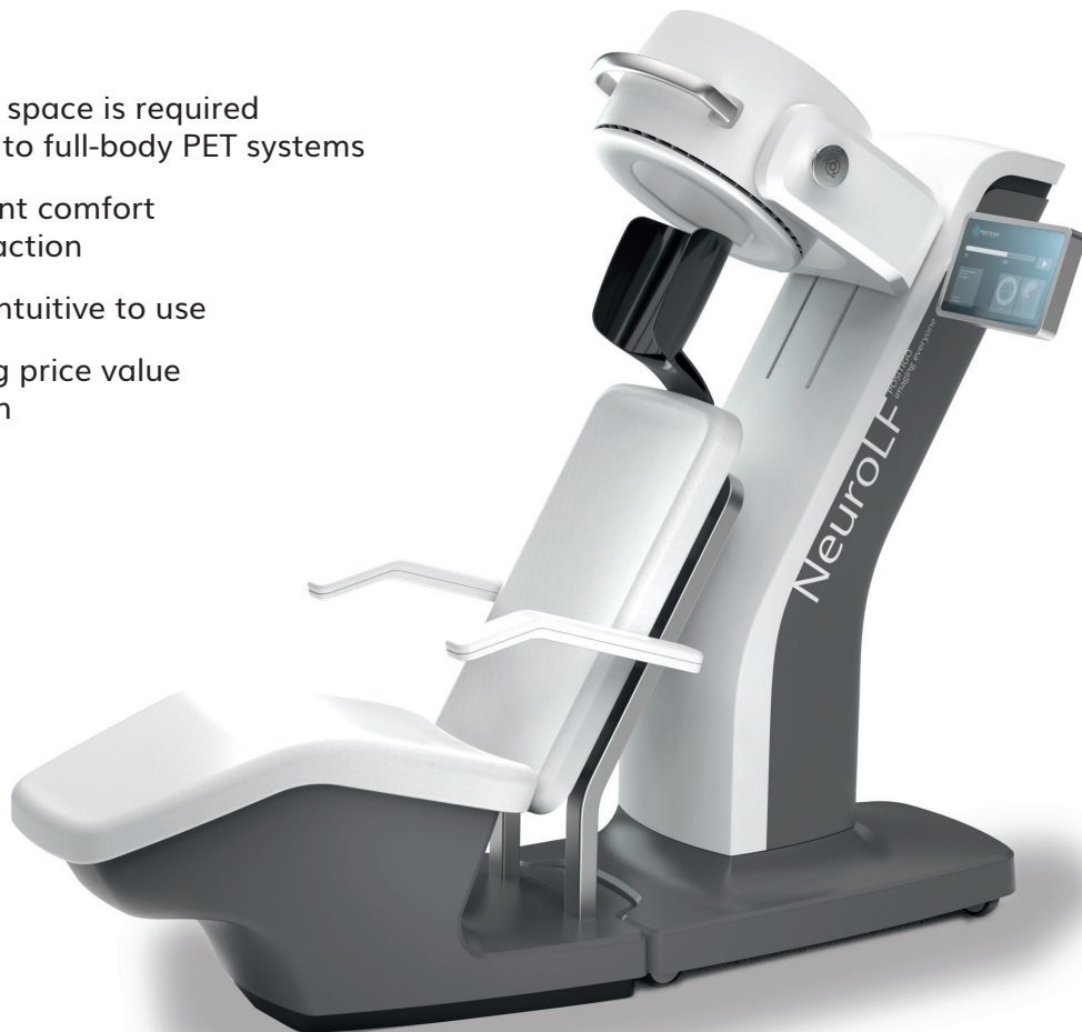
Illustration above is a design prototype, the original device might look slightly different.

NeuroLF® is not yet commercially available and must only be used for investigational purposes for now.