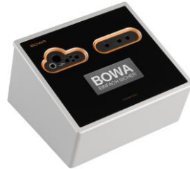
Figure 3: Comfort Box (BOWA)

The Comfort instruments by BOWA can be checked by the Comfort Box (Figure 3) and an additional test device for functionality and lifespan. So it is possible even in this process step to identify defective instruments or those that can no longer be used.